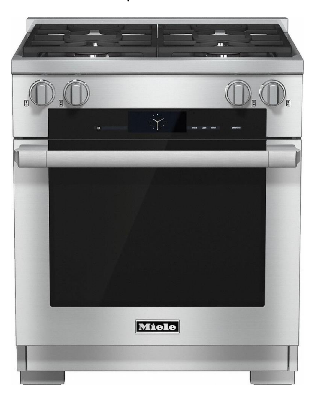
Miele 30" dual fuel range with 4 burners $ 4899.99