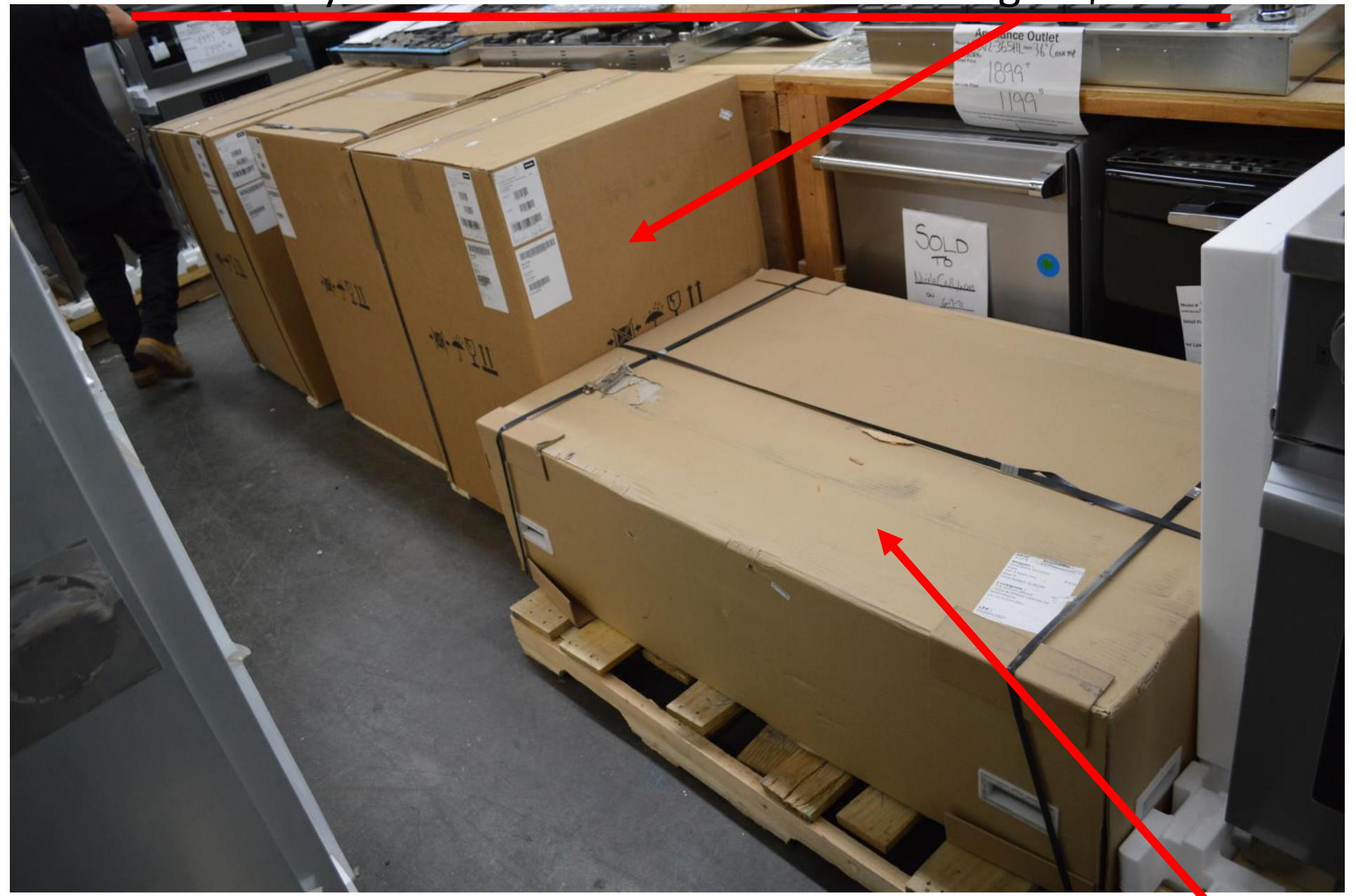
48" range top with 6 burners and griddle $ 3599.99

Panel ready and stainless dishwashers starting at $ 999.99